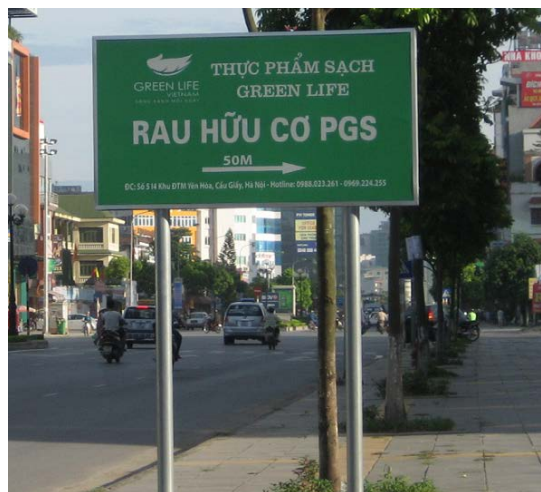
Board sign to shop